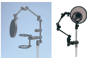
SPF used in SPK